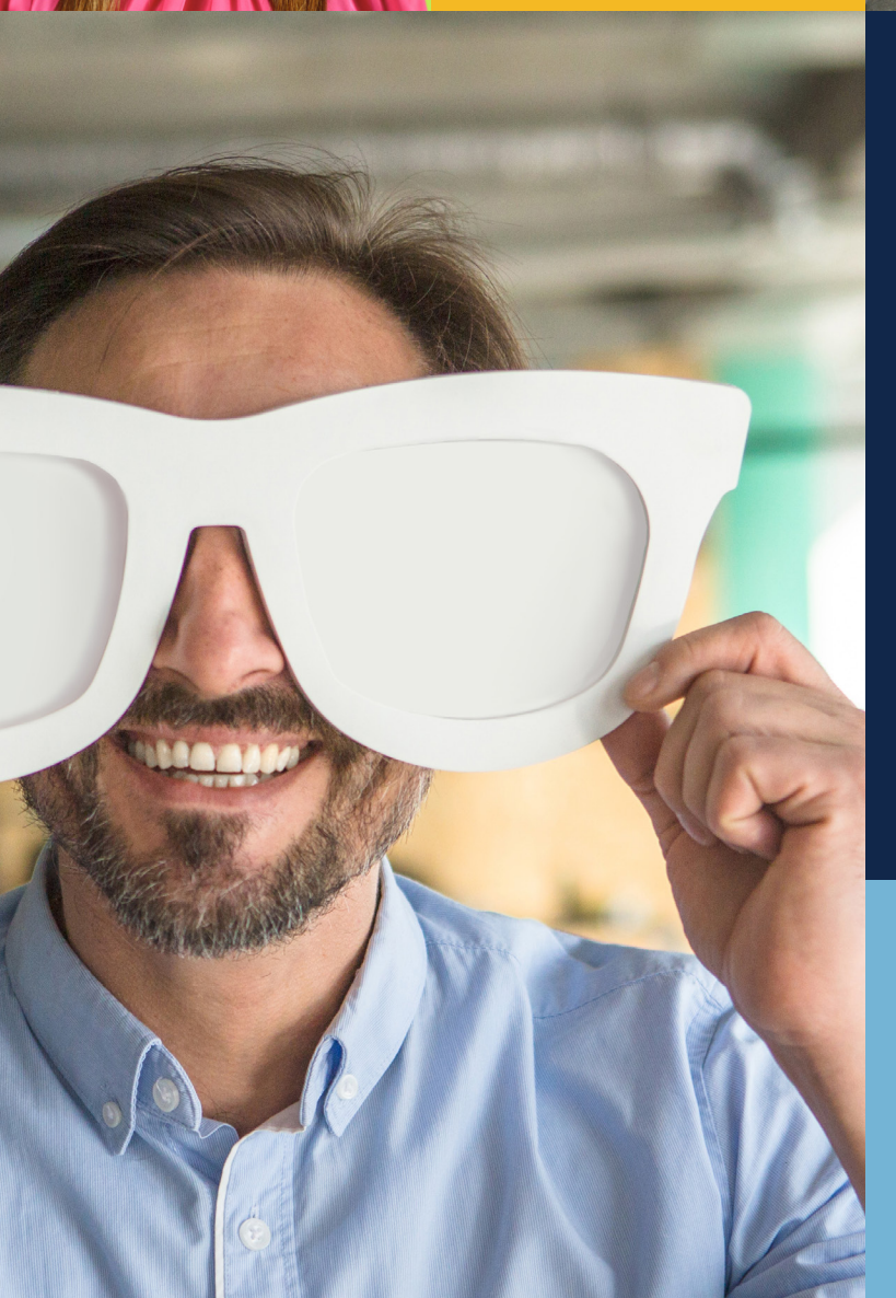
Adaptability Coaching and development

We can act as your off-site Human Resources department, offering outsourcing solutions and consultation in the areas of performance management, absence, conflict, redundancy, dismissals and learning and development, alongside other areas which help you to manage your business.