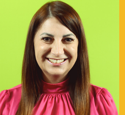
Support when you need it Accuracy and compliance